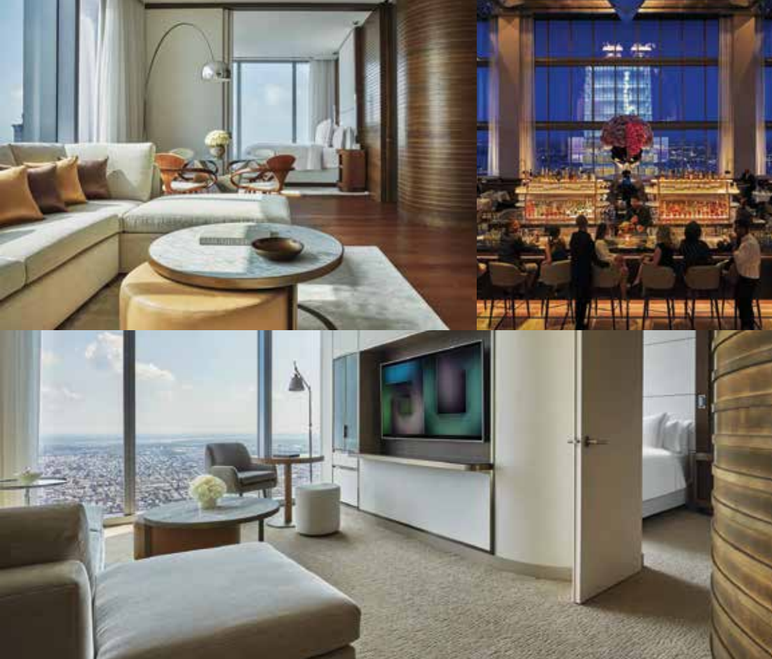
top, left: The Skyline Corner Suite includes a table for four top, right: Sophisticated dining at the Jean-Georges Philadelphia on the fifty-ninth floor bottom: The Cityscape Suite offers views of City Hall and the Delaware River below: The fifty-seventh floor has an indoor pool that seems to spill into the sky, a state-of-the-art fitness center and a wellness boutique and seven-room spa for pure serenity.